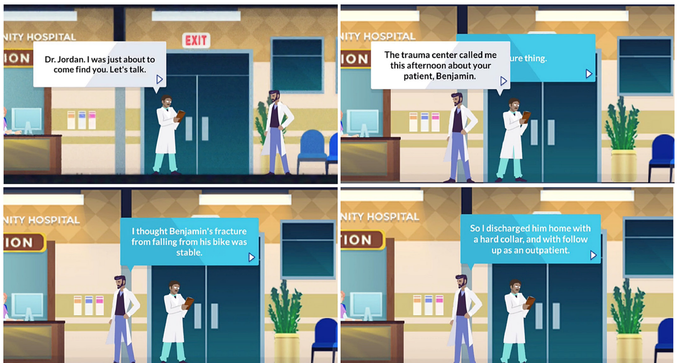
Fig 1 | Selected screenshots from interaction between Andy and his boss, the department chair. In this instance, Andy has failed to transfer a patient (Benjamin) with a cervical spine fracture to a trauma center, and Benjamin has returned with a central cord syndrome. During the conversation, players can choose how they want to respond to the department chair's criticism of their performance, either accepting responsibility or arguing that the complication represents the natural evolution of the disease process rather than a diagnostic error

The ideal standard educational strategy in trauma is Advanced Trauma Life Support (ATLS)—a two day seminar designed to teach participants to resuscitate and stabilize trauma patients and to determine if